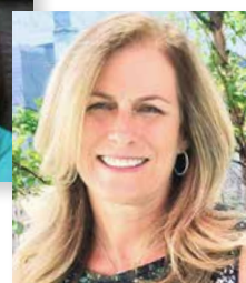
Margaret Helmig Ogilvy Healthworld